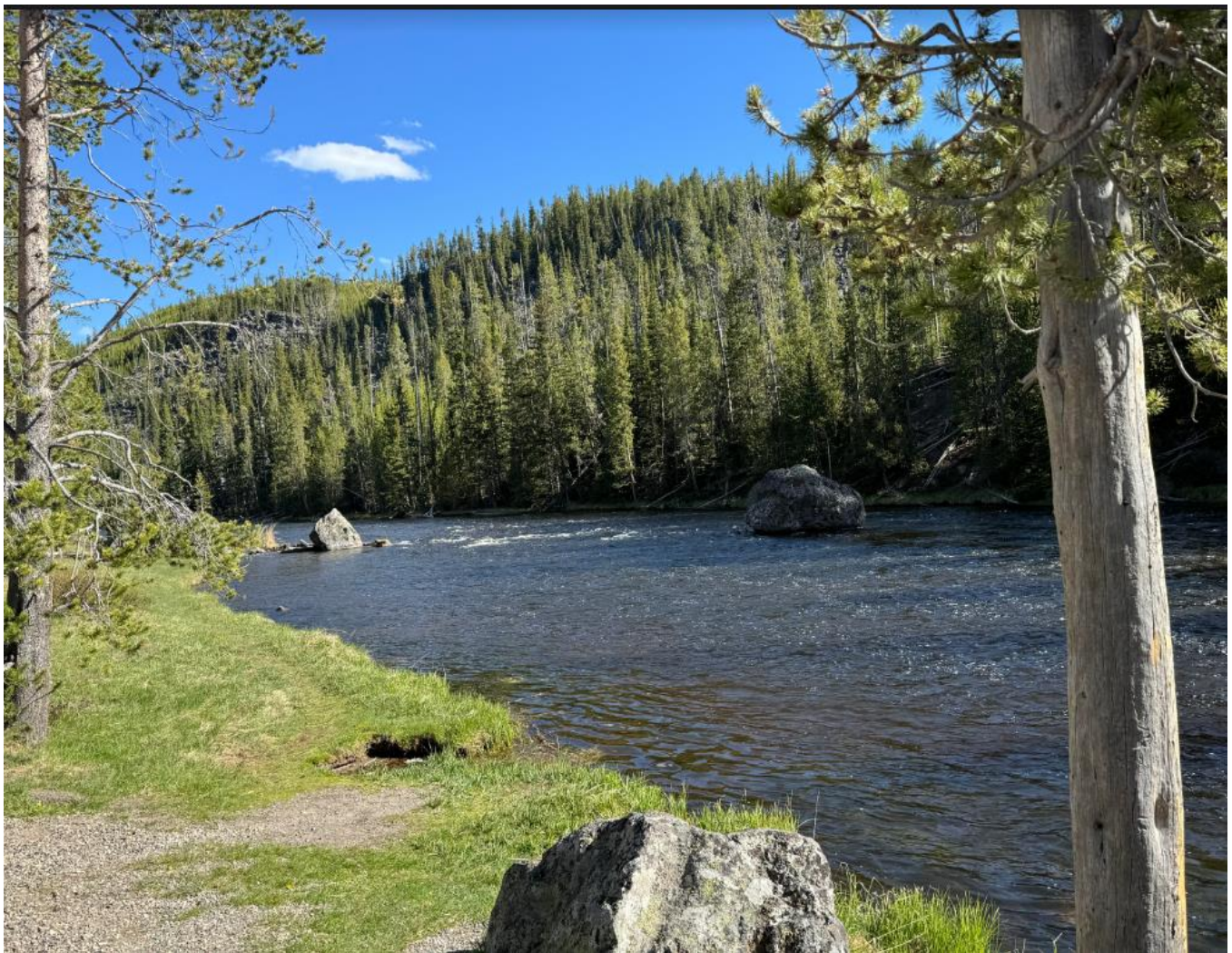
Firehole River in Yellowstone

September 12-15 – Georgetown Lake Float (Hosted by Dan Wight) – Click here for info and registration: https://spokaneflyfishers.com/event/georgetown-lake-outing/#!event-register/2024/9/12/georgetown-lake-outing